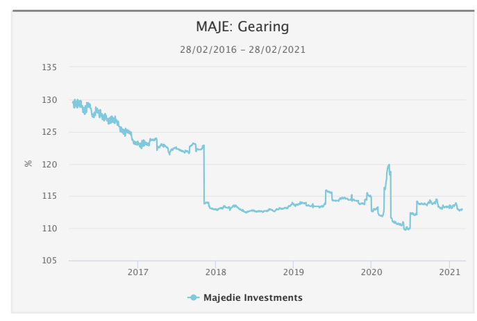
Fig.2: Five-Year Gearing

By using structural gearing, as opposed to a revolving credit facility, MAJE will have a largely consistent level of gearing, where changes in the gearing level fluctuate as a result of NAV movements rather than increased leverage. A prior debenture was redeemed in 2017, which reduced the level of gearing as a result, as can be seen in the chart below. The use of gearing is at the sole discretion of the board, subject to the restrictions of the trust.