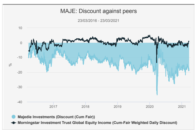
Fig.6: Five-Year Discount

We note that MAJE was in the AIC global equity sector until December 2020, which we think means investors may have undervalued the yield and dividend growth potential. With the trust now in a more appropriate peer group, and standing out with regards to income generation, we think there could be scope for a significant narrowing of the discount. With the UK bias of the portfolio looking attractive at this point in time thanks to the UK's cheap valuations and strong vaccination programme, this could provide further impetus. We note, however, that a large investor in the trust, Aviva Investors, has been selling down its position for some time, increasing downward pressure. With its holding now 7%, from 13%, we believe the pressure could start to be outweighed by the positive factors.