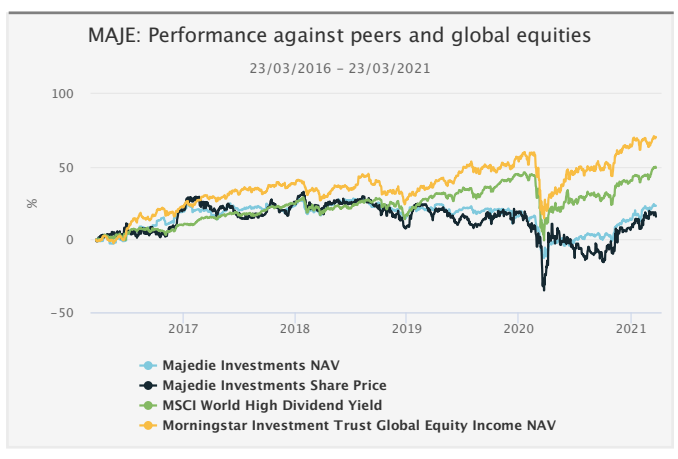
Fig.4: Five-Year Performance

growth stocks and high-quality consumer names have driven markets globally. MAJE's underweight to the US has also been a factor in its relative underperformance, given it has been the best performing market over recent years. As a result of these factors MAJE has generated a NAV total return of 20.6% over the past five years, and a share price return of 14.9%, underperforming the 72.6% NAV total return of its global equity income peers. While MAJE does not benchmark itself against any index, for reference we include the MSCI All World High Yield Index for comparison, which has generated a five-year return of 56.5%.