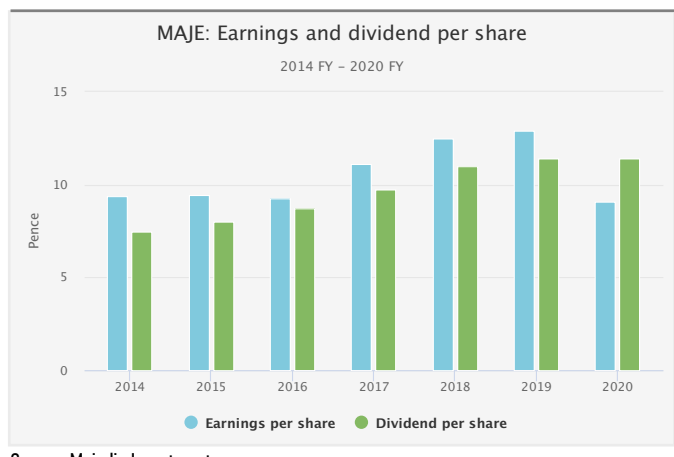
Fig.5: Earnings And Dividend Per Share

We estimate that once the 2020 dividend is deducted, the remaining revenue reserve covers the dividend by four times, a considerable safety margin for the trust and one of the largest coverage ratios of any investment trust. Since MAM was appointed as manager in 2014, MAJE has managed to grow its dividend by 6.4% per annum, easily in excess of 1.2% per annum growth in the UK consumer prices index.